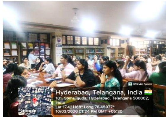
NDLI AWARENESS PROGRAM