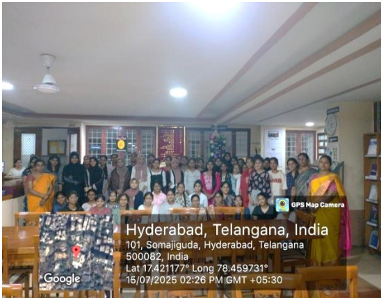
LIBRARY INDUCTION PROGRAM