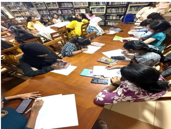
INTERCOLLEGIATE BOOK REVIEW