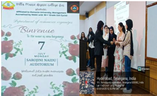
Bienvenue! The wave of new beginnings! - An informal orientation organised for the first-year students of B. Com