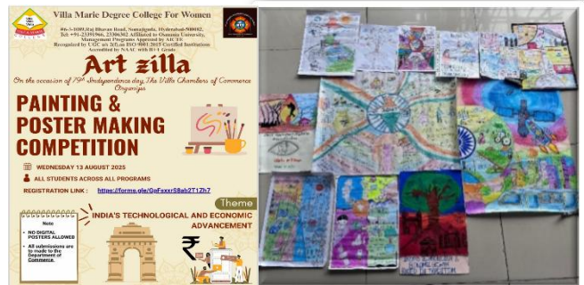
Art Zilla a painting and poster-making competition