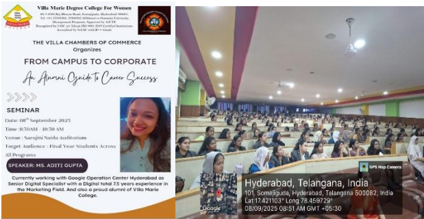
Glimpses from the Seminar - "From Campus to Corporate: An Alumni Guide to Career Success."