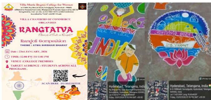
Glimpses from the Rangoli competition