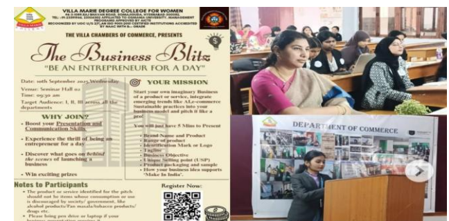
Glimpses from the Business Blitz Competition.