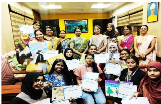
Paint a Poem