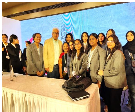
Hindu- Lit for Life