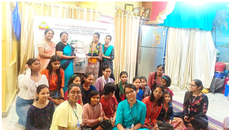
Visit to the Orphanage