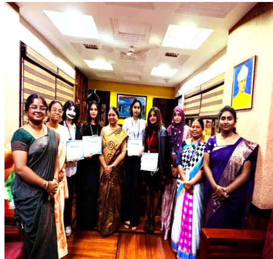
Frankenstein Day Fest