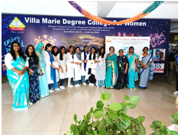
Villa Conclave 3.0