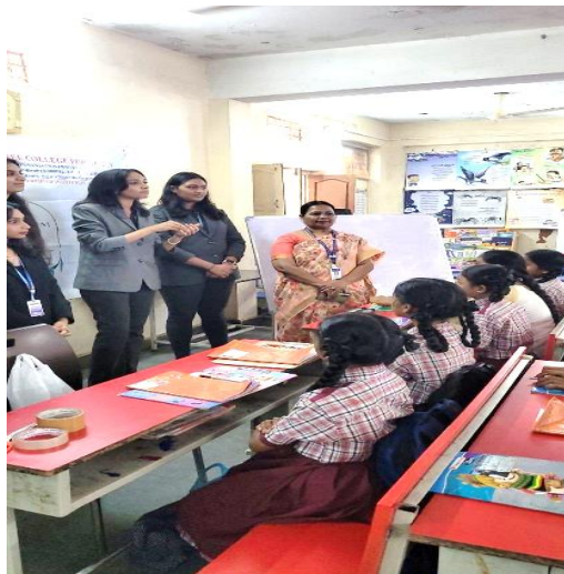
International Literacy Day

Through these diverse and thoughtfully designed programs, the Department of English continues to inspire academic excellence, creative expression, and civic responsibility among both students and faculty.