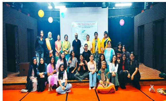
Visit to the theatre