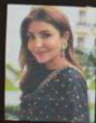
ANUSHKA SHARMA SOCIAL ANXIETY