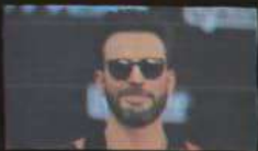
CHRIS EVANS SOCIAL ANXIETY