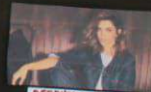
DEEPIKA PADUKONE DEPRESSION