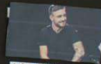
LIAM PAYNE SUICIDAL THOUGHTS, ADDICTION