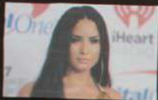
DEMI LOVATO BIPOLAR DISORDER