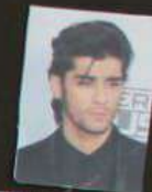
ZAYN MALIK EATING DISORDER