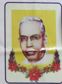
Dr. S.R. RANGANATHAN 1892 - 1972

Department Of Library & Information Centre